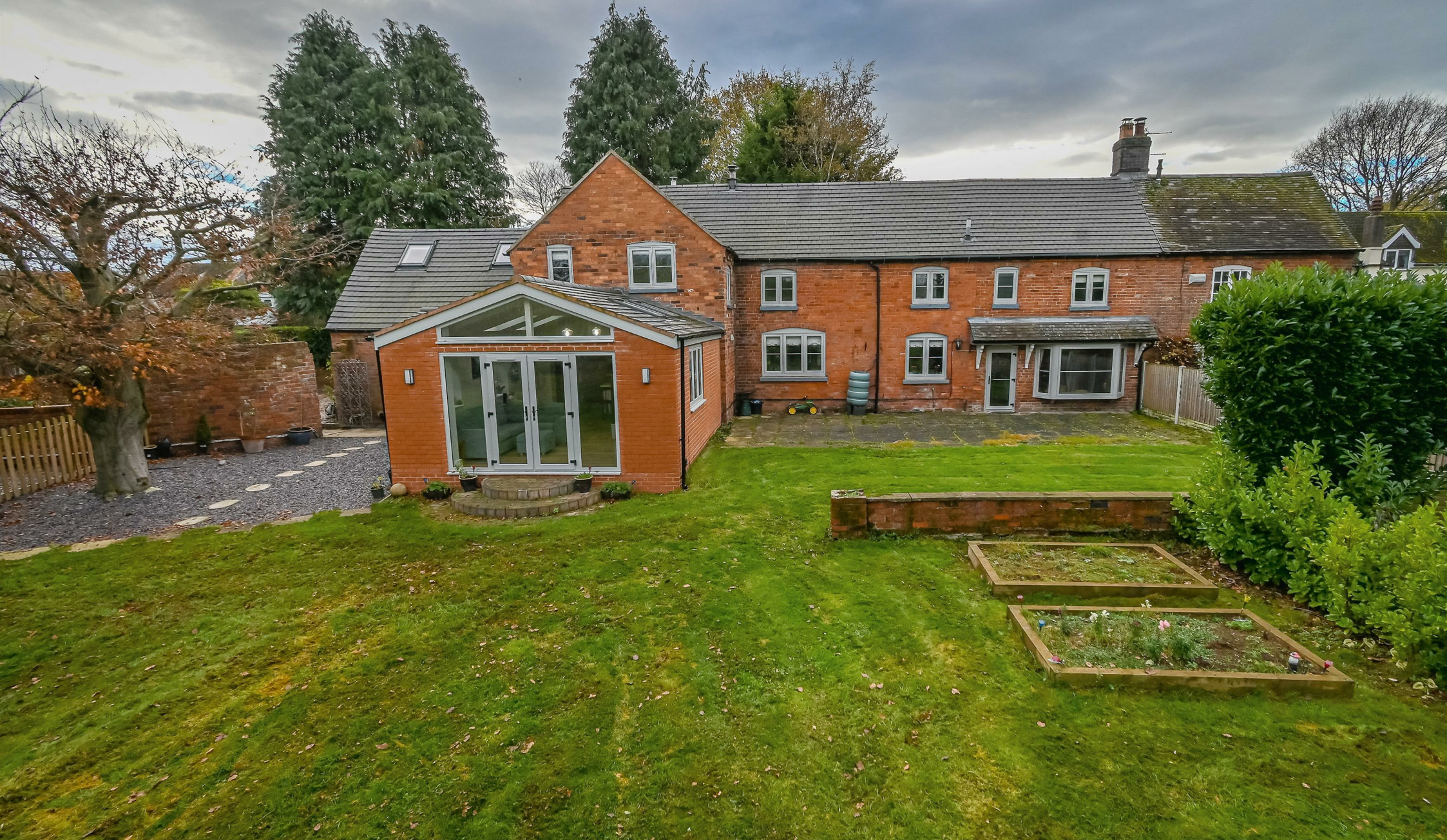
Orchard Cottage, Rudge Heath Road, Claverley, Wolverhampton, Shropshire, WV5 7DJ